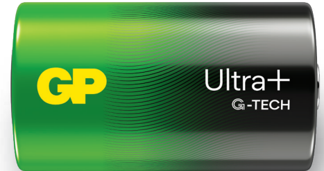
Model No.: GP13AUP

This specification is applicable to GP Ultra Plus Alkaline Cell, GP13AUP (No mercury added).