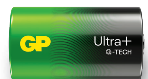
Model No.: GP13AUP