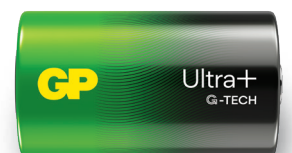
Model No.: GP13AUP

Note 3: AQL General Inspection level II, single sampling plan.